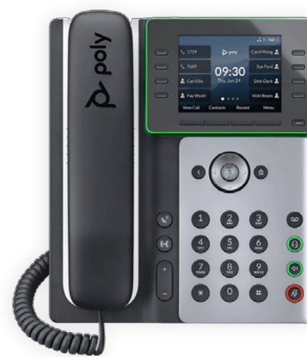
Poly Edge E320