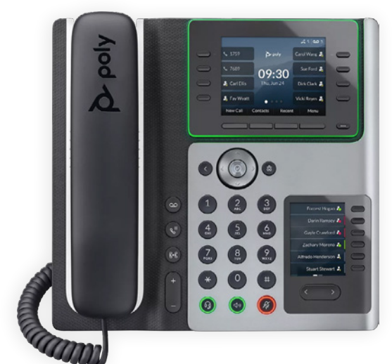
Poly Edge E400