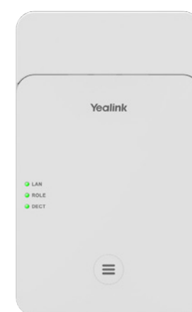
Yealink DECT W75B