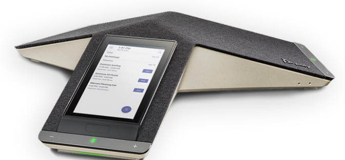
Poly Trio C60