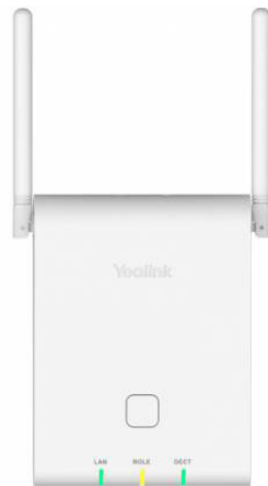
DECT IP Multi-Cell Base Station W90B