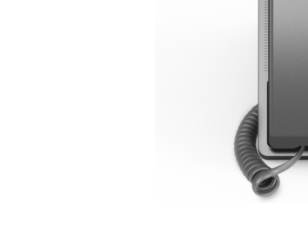
Flyingvoice FIP16 Plus