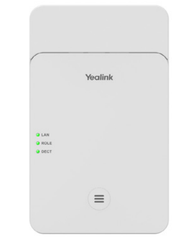
Yealink DECT W75B