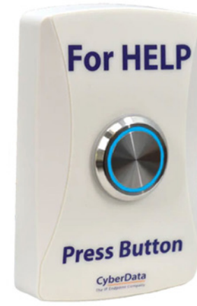
CyberData SIP Call Button