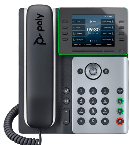
Poly Edge E300