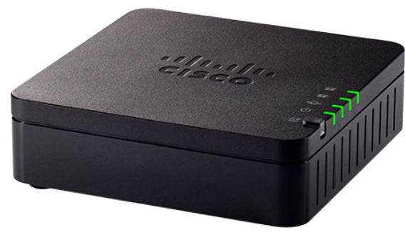
Cisco ATA 192