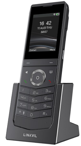
Fanvil Linkvil W611W