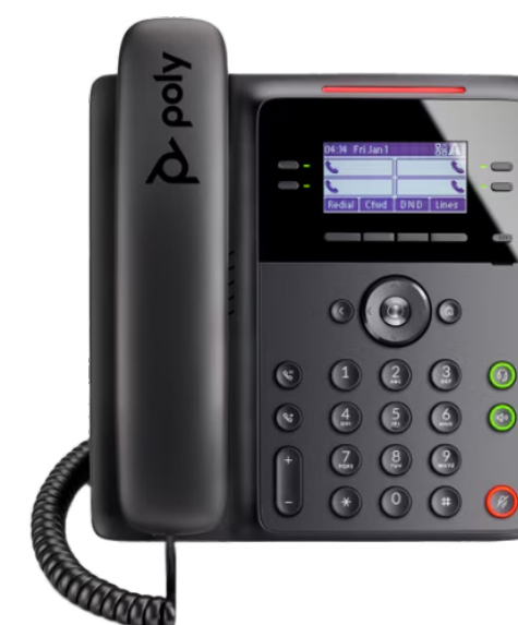
Poly Edge B10