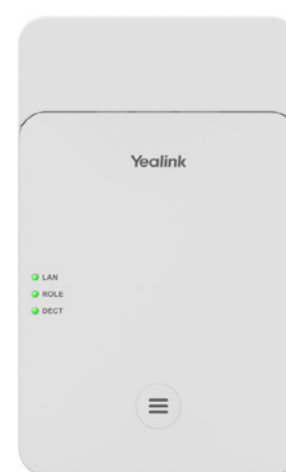
Yealink DECT W75B