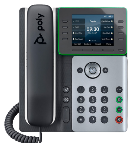
Poly Edge E300