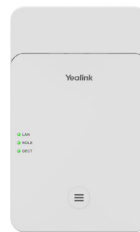
Yealink DECT W75B