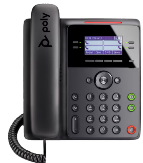
Poly Edge B10