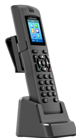
Flyingvoice FIP16 Plus