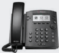
Polycom VVX 300

Plug and Play with a simple Setup Wizard. Once the Key System is initialized, all supported phones are automatically provisioned and ready for use.