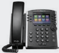
Polycom VVX 400